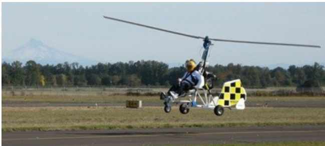
Above: Kevin Richey lands at Scappoose.

The next meeting will be June 12, 2010 at 1:00 PM in Scappoose, OR at the Sport Copter Hangar. The meeting was adjourned at approximately 2:26 PM.